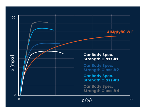
AlMgty®vs. other aluminium allyos for the LPBF process